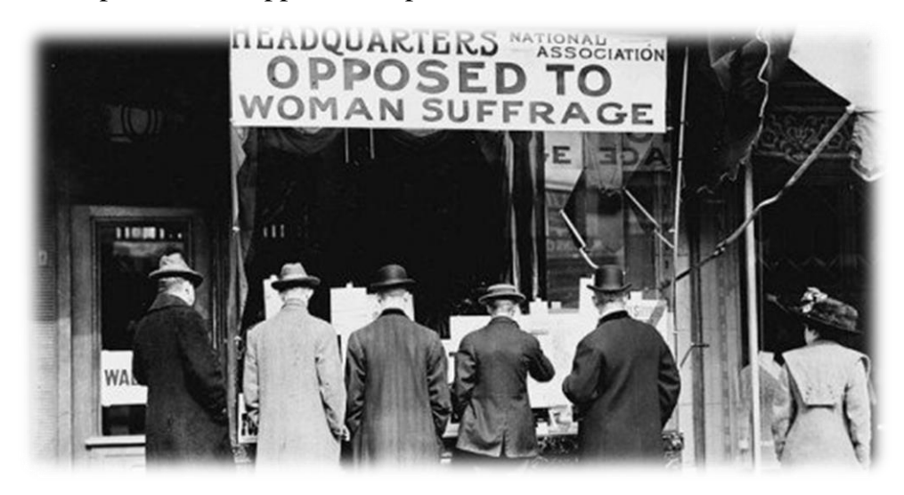
Fig 1: In the past, women's suffrage was prohibited and forbidden even in the western world

In the past (before the late 1960s), women's issues were not given any form of priority in development policies and programmes. The economic activities ad contributions of women were completely ignored and not valued (Mosse, 1993). Development theorists and planners considered men as the main agents and actors of development. This is because men were mostly the breadwinners of their families, as such their development and support were paramount.